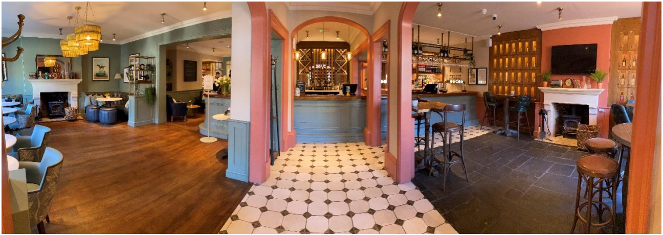
View from entrance into bar area