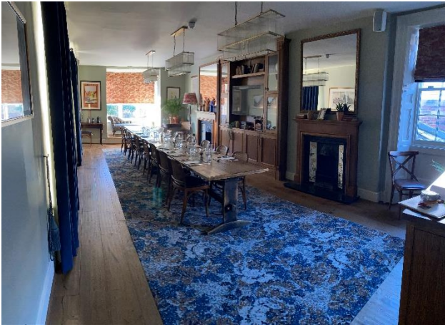
View into Garden View from the doorway