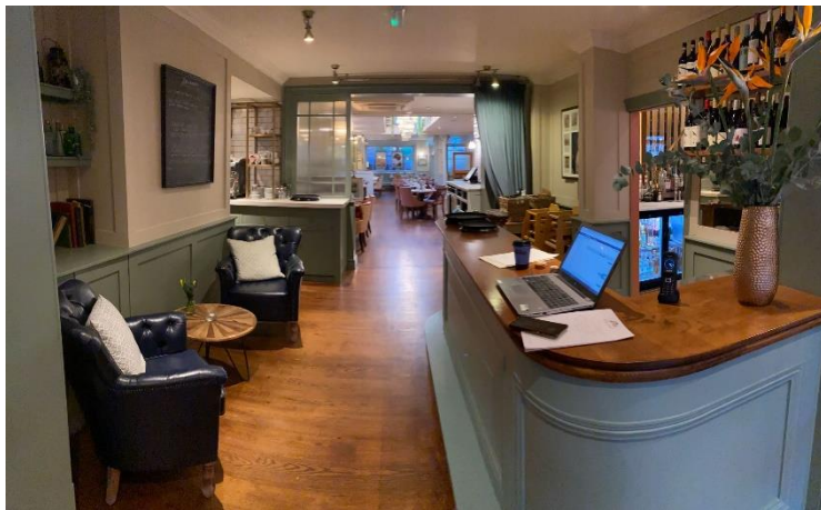
View from bar area into restaurant