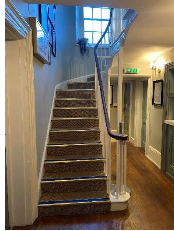
View of staircase up to first floor