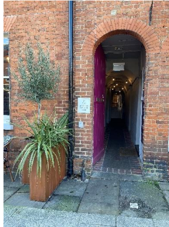
From the street to the main entrance From the street to the side entrance