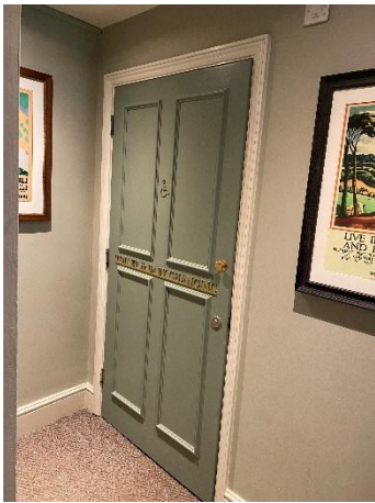
Doorway to accessible toilet