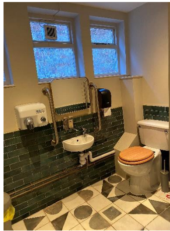
Inside accessible toilet