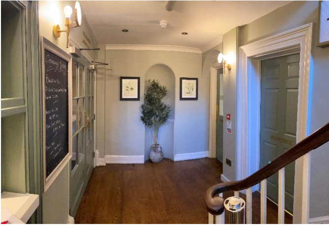
View from side entrance to ground floor corridor