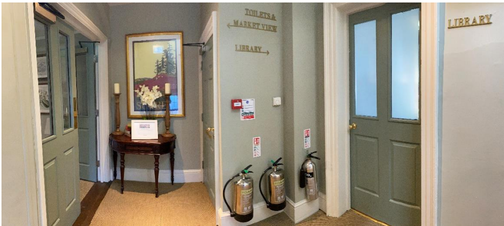
View from staircase to first floor landing