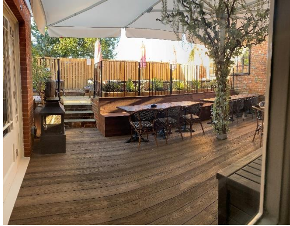
Entrance from restaurant to patio View from doorway to patio