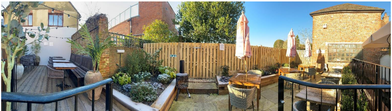
View of upper patio from steps