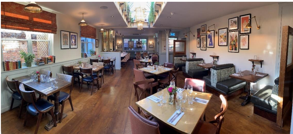
View into restaurant